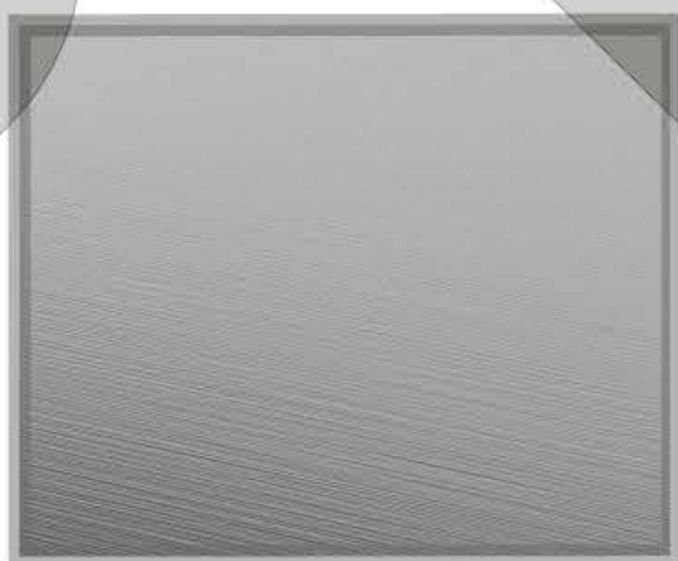
BS Brushed Silver