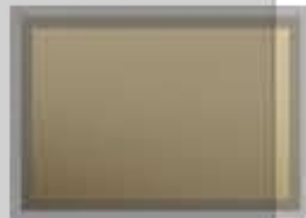
PG Polished Gold