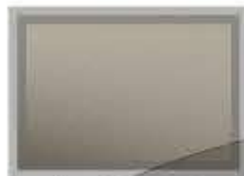
8P Champagne Satin