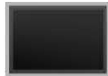
PB Polished Black