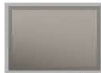
6B Copper Brushed