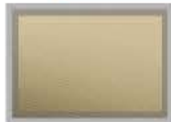
BG Brushed Gold