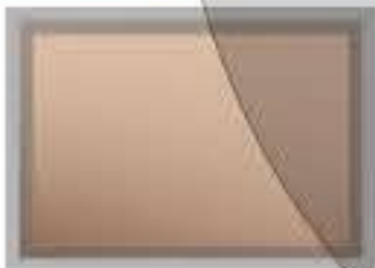
PR Polished Rose