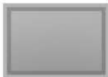
PS Polished Silver