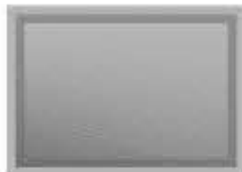
BS Brushed Silver