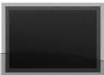
15P Gun Black