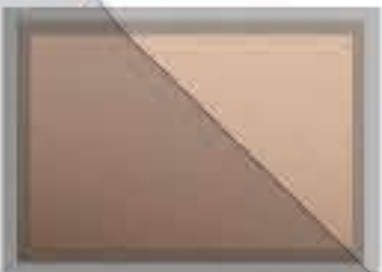
BR Brushed Rose