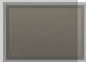
7B Bronze Brushed