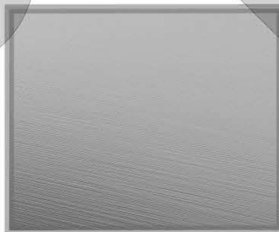
BS Brushed Silver