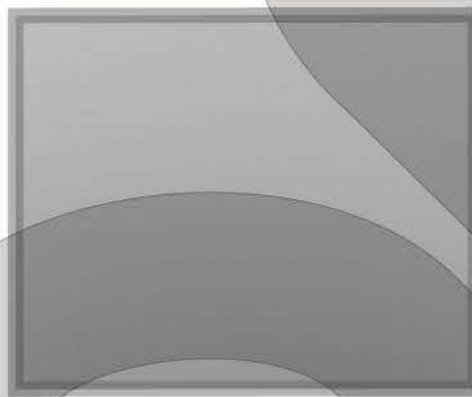
PS Polished Silver