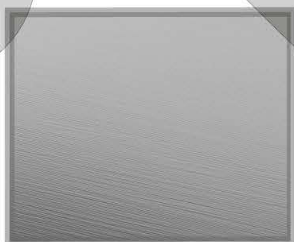
BS Brushed Silver