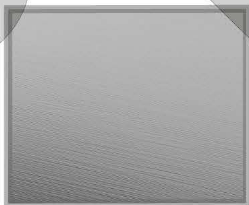
BS Brushed Silver